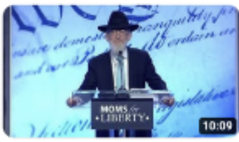
Rabbi Yaakov Menken at the 2023 Moms for Liberty Summit 45 views • 4 hours ago