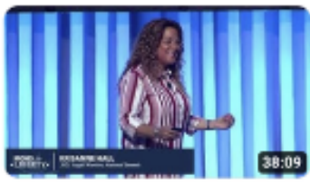
KrisAnne Hall at the 2023 Moms for Liberty Summit 32 views • 5 hours ago