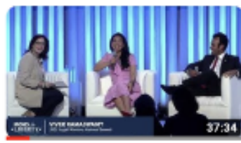
Vivek Ramaswamy at the 2023 Moms for Liberty Summit 27 views • 1 hour ago