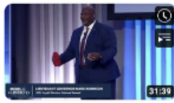
Lt. Governor Mark Robinson at the 2023 Moms for Liberty Summit 41 views • 4 hours ago