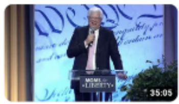
Dennis Prager at the 2023 Moms for Liberty Summit 34 views • 3 hours ago