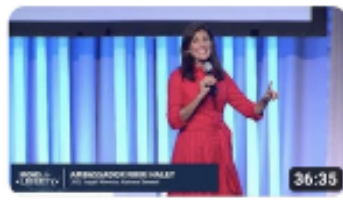
Ambassador Nikki Haley at the 2023 Moms for Liberty Summit 42 views • 6 hours ago